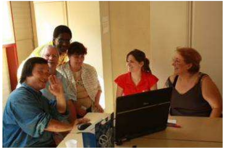
Fellowship with the French Deafies